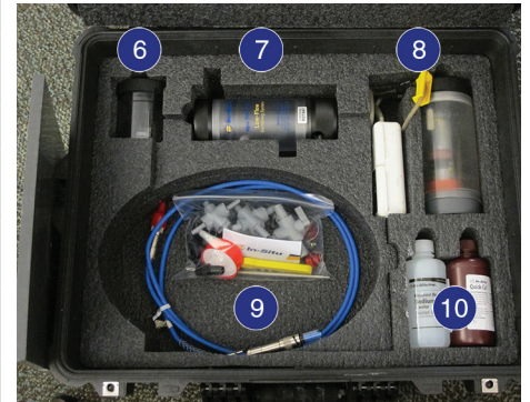
6) Aqua TROLL 600 Calibration Cup; 7) Low-Flow Flow Cell; 8) DO Bubbler Kit; 9) Tefzel Cable, fittings kit, and base plate (not shown); 10) Quick Cal Solution and Sodium Sulfite Solution