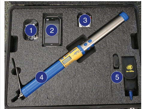
1) Micro USB charger for Android phone and Wireless TROLL Com; 2) Android Smartphone w/ VuSitu App; 3) Batteries; 4) Aqua TROLL 600 Multiparameter Water Quality Sonde; 5) Aqua TROLL 600 Wireless TROLL Com with carrying case and belt clip