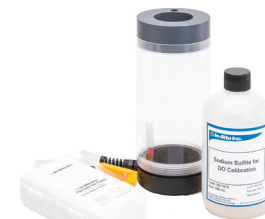
Dissolved Oxygen Bubbler Kit